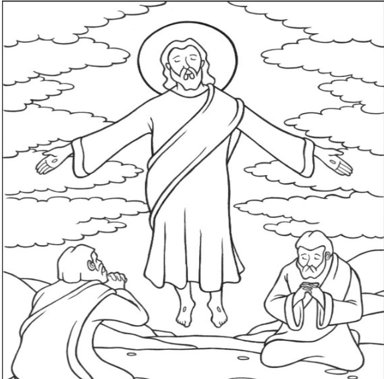
2nd Glorious Mystery: The Ascension