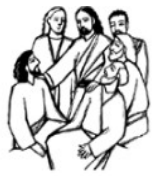
Calling the Twelve to him, he sent them out two by two. Mark 6:7 (NIV)

Choose the word that best matches the definition. Answers can be found in Mark 6:6-13 (NIV)