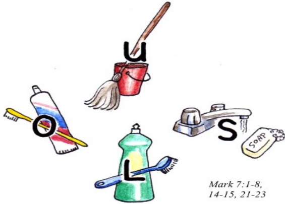
Mark 7:1-8, 14-15, 21-23

22nd Sunday in Ordinary Time September 1st, 2024